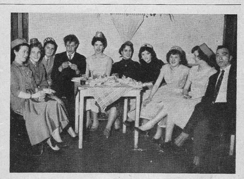
A happy group from the Bottling Department.