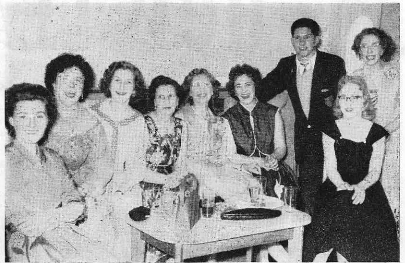
A group taken at the West Country Dance.