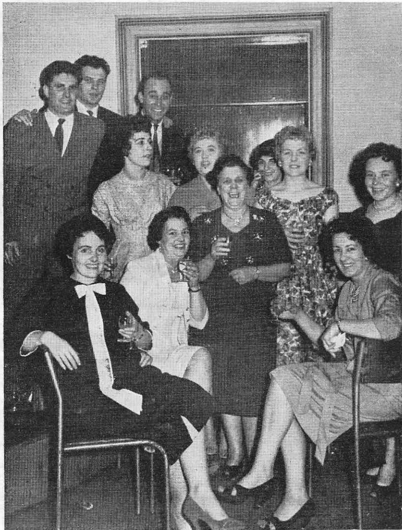
Some cheerful partygoers at Newport.