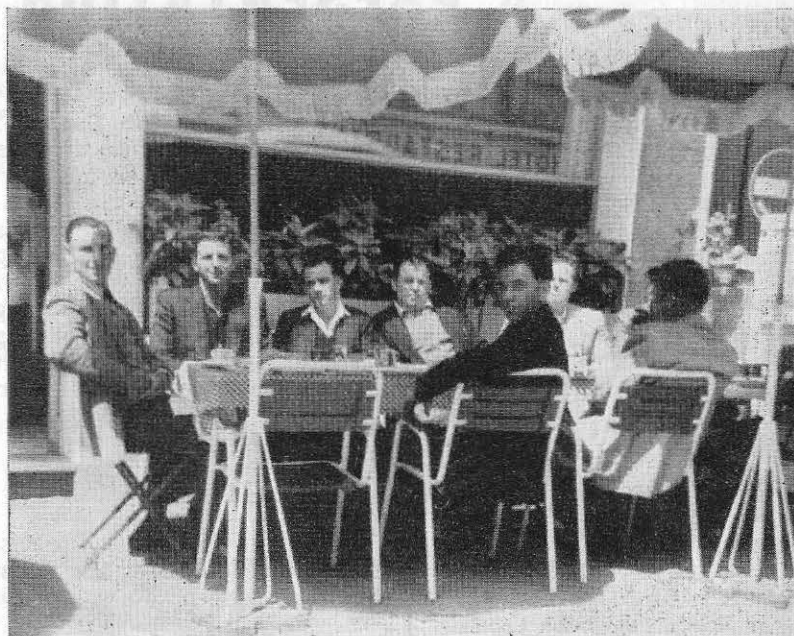
Some carefree members of the Reading Transport Staff relax outside a cafe in Boulogne