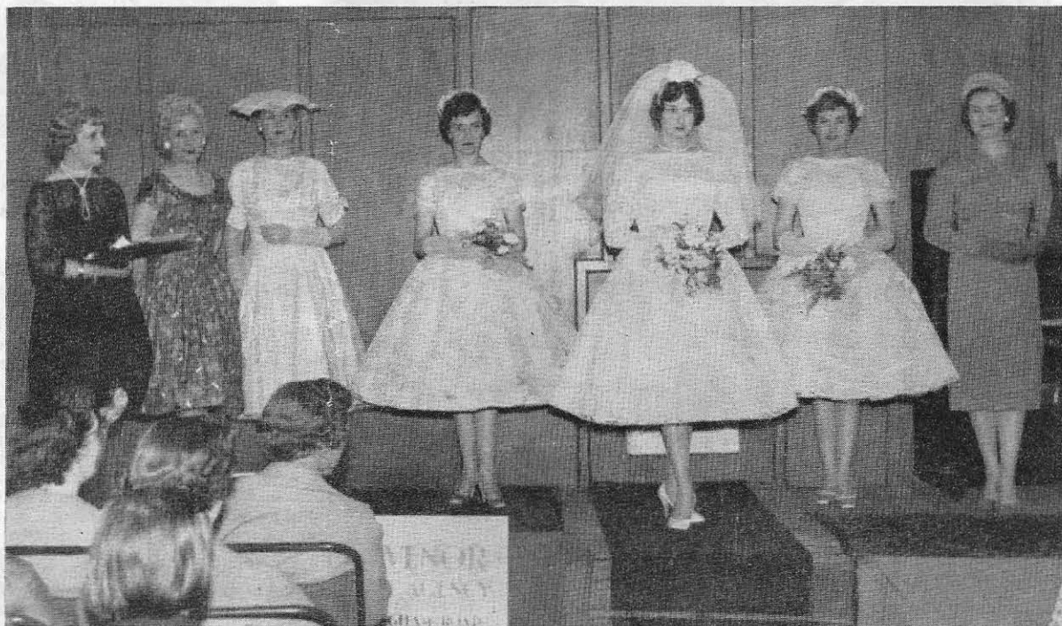
The Grand Finale at the Fashion Display.

The evening, which was organized for the Social Club Committee by the Hon. Secretary was much enjoyed by the 130 lady members, members wives and girl friends who attended, and it is hoped that another similar evening can be arranged in the future.