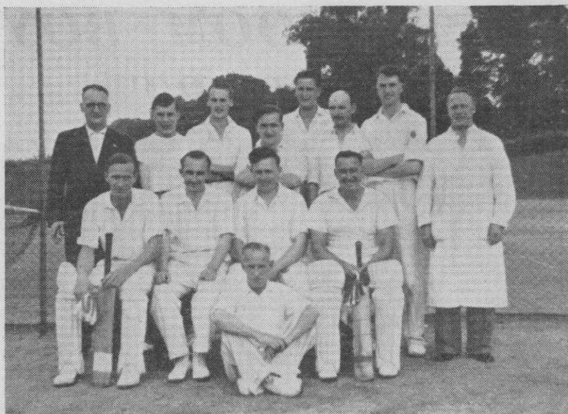
The Reading 'B' Team.