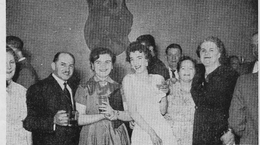
People at the Newport Branch Dance who were obviously enjoying a very happy occasion.