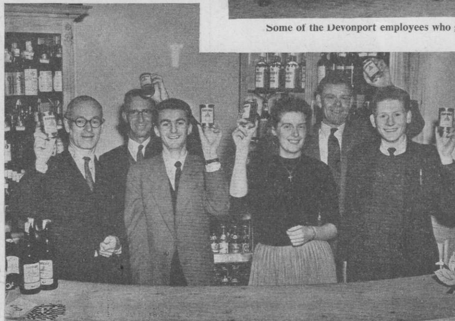
Members of the Oxford Branch staff hold up their gifts of Tavern.