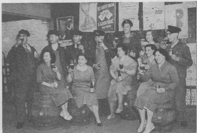
Some of the Devonport employees who gathered together to celebrate.