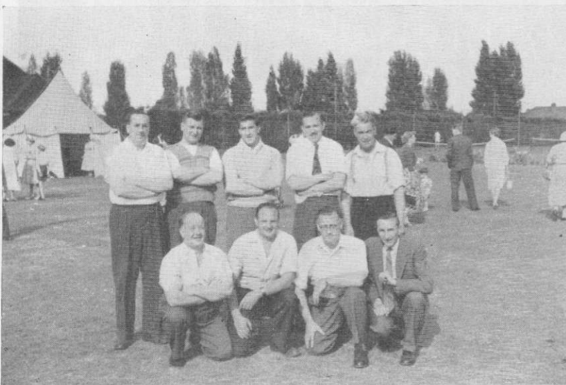
Winners of the Tug-of-War—the Production Department.

The proceedings were rounded off in the evening with dancing to the music of the Astorians Band.