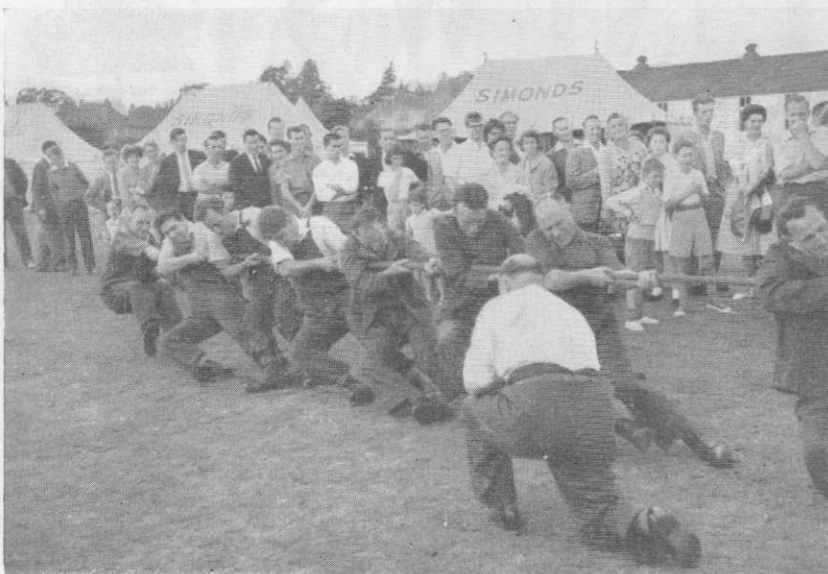
Newport getting up a thirst.

A Horticultural Show and an exhibition of pigeons were two new features of this year's Sports Day, which was held on August 15th in perfect weather. Several hundred people attended and it was pleasing to see representatives present from Newport, Staines, Brighton and Gloucester branches.