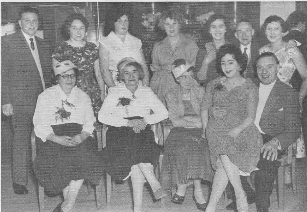
The Bottling Staff at Staines pose for a picture at their Annual Dance.