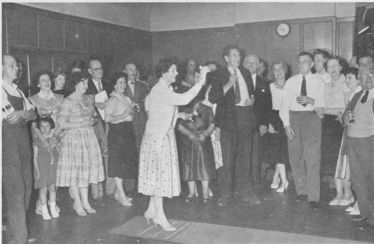
Some of those who took part in the recent Mixed Darts Tournament at the Social Club.

Two Branch Parties were held at just about the time that our last issue went to press. These were the Staines and London Branches Dance on March 18th, and the