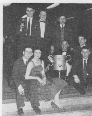
The winners of the "Simonds Stakes" at the Newport Branch Dance.

Recently the team entered two rallies, the first of which was held at Huntley & Palmer's Sports Ground on May 14th. They suc-