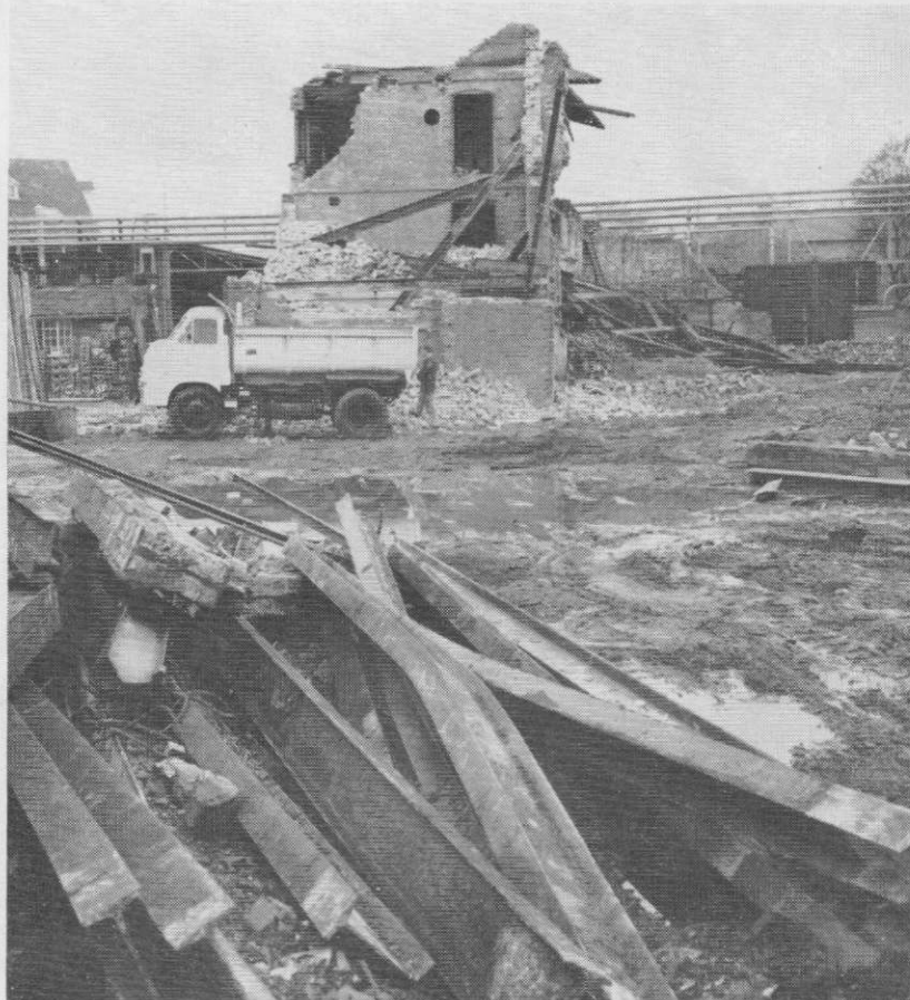
This scene, reminiscent of the last war, was taken while demolitions were in progress in the South Berks yard at Reading.