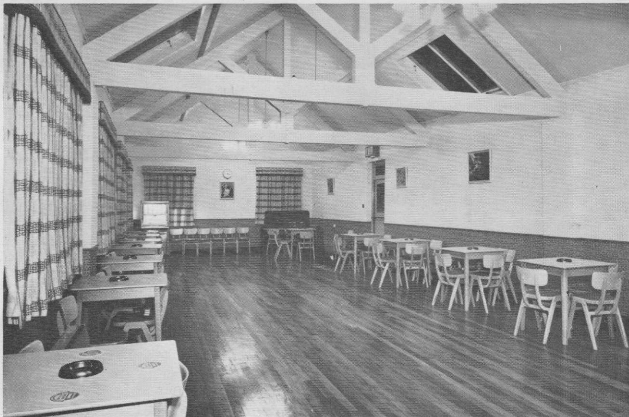
The Functions Room at the Club.

October 13th—Newport Branch Annual Dinner and Dance.