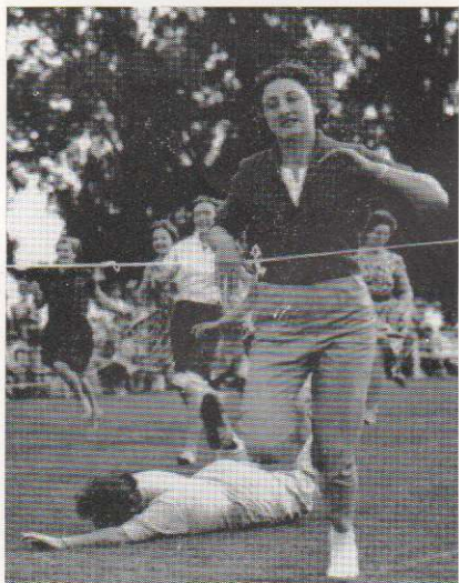
So near and yet so far — a casualty near the finish of the Ladies Race