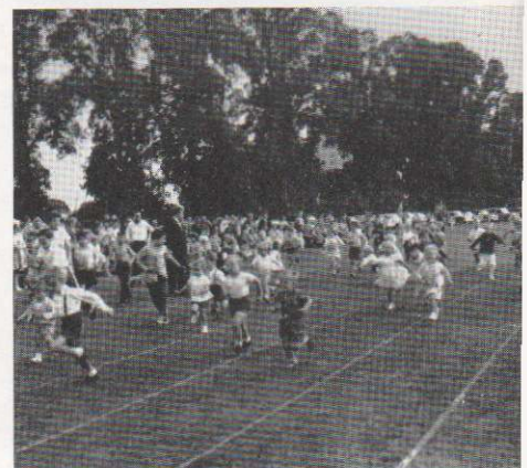
Tiny Tots Race