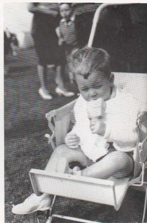
One member of the crowd who quite plainly enjoyed himself