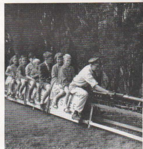
A ride on the model railway at the Central Area Sports Day and Fete