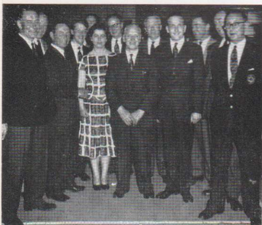
Members of the Courage and Barclay Rifle Section who attended the L.B.A.S.A. Rifles Section Trials at Park Street

We are pleased to be able to report that our team were runners-up in the L.B.A.S.A. league, being beaten in the final shoot-off by Guinness.