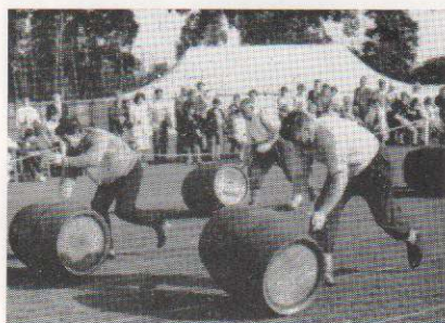
Barrel rolling race