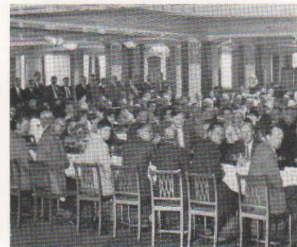
A general view of those who attended the Alton annual outing