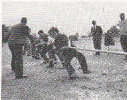
The Reading Transport tug of war team pull their way to victory