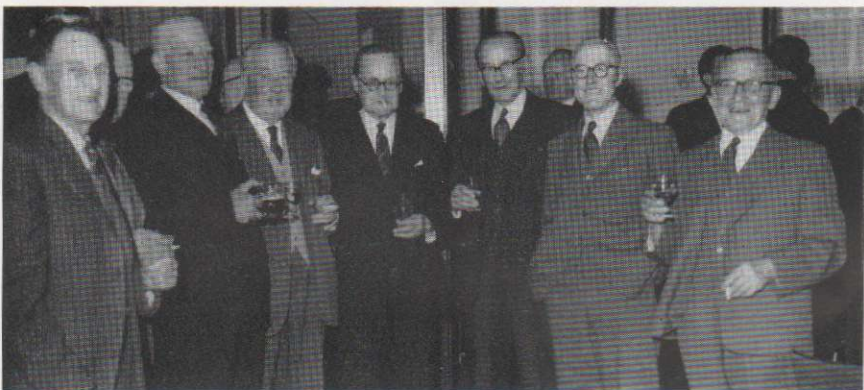
A cheerful group of Pensioners having a drink before dinner in Seven Bridges House—no doubt with plenty of news to exchange