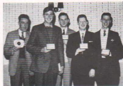
The 'B' team, winners of the knock-out championship

only one match against Guinness 'A', the result was in doubt right up to the last match. Our 'B' team, shooting in the London Breweries Reserve League, started off right out of form but gradually pulled themselves together, unfortunately too late to get among the winners. As a consolation, however, they did win the knock-out competition against all 'A' and 'B' teams.