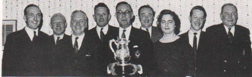
The 'A' team with the Law Cup

"We are very pleased to announce that, after a lapse of a couple of years, our 'A' team has regained the Championship of the London Breweries League and, with it, the 'Law' Cup. Shooting very consistently throughout the season, and losing