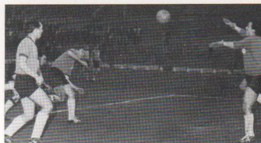
The brewery attacking—Stone and Spring