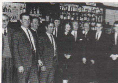
Members of the Angling Section in the Social Club, Park Street