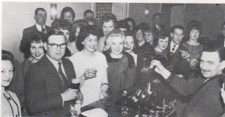
Sales Accounts (Bristol) Social Evening