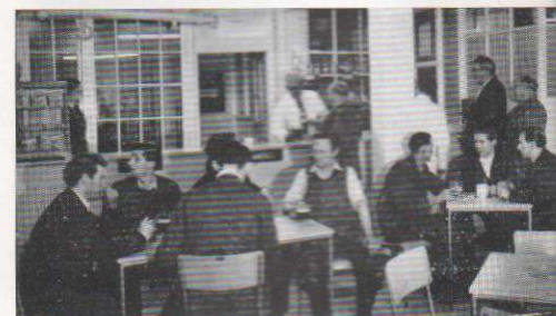
The new "Cockerel" Tavern at Bristol

The old Mess Room has now been demolished as part of the extensive rebuilding programme taking place at Reading.