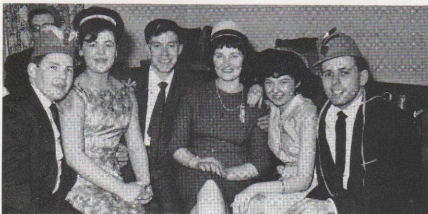
Bridgend Branch Annual Party—Members of the staff enjoying themselves