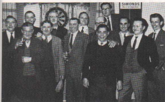
A cheerful group from the Production Department The Wine Stores came along with plenty of supporters—but this year they were out of luck

The evening, which was organised by the Social Club Committee, was one of the most successful and best attended for some years past.