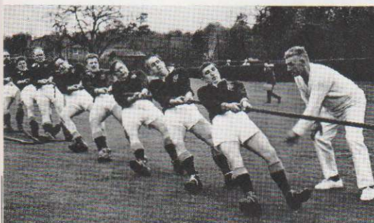
The Tug-of-War team during a practice evening at Hayes.