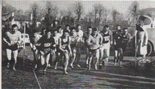
London Breweries' Cross Country at Hayes.