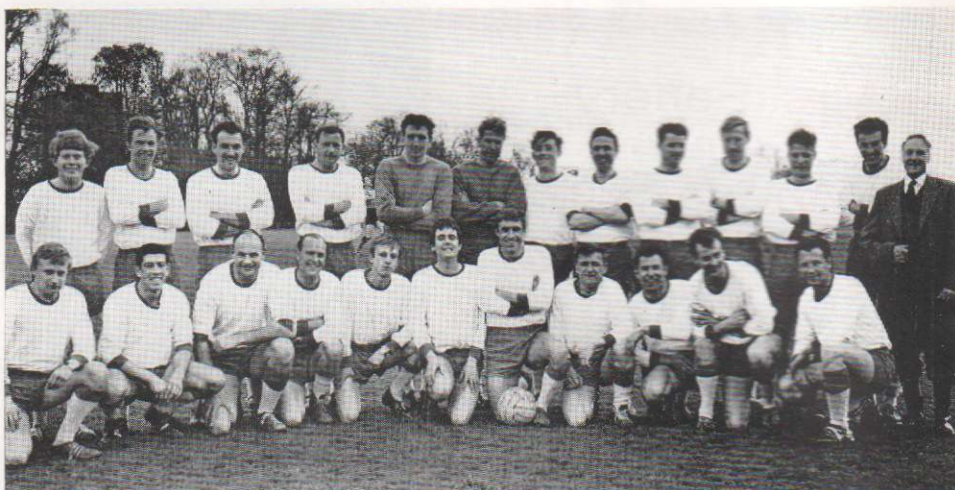
The triumphant First and Second Football teams photographed at the Reading Sports Ground.