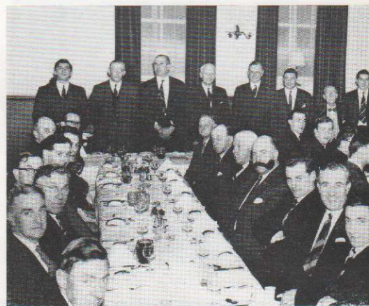
Courage (Bristol) Cricket Club dinner at the Assize Courts Hotel

The captain responded with customary good-humour, referring to the club's