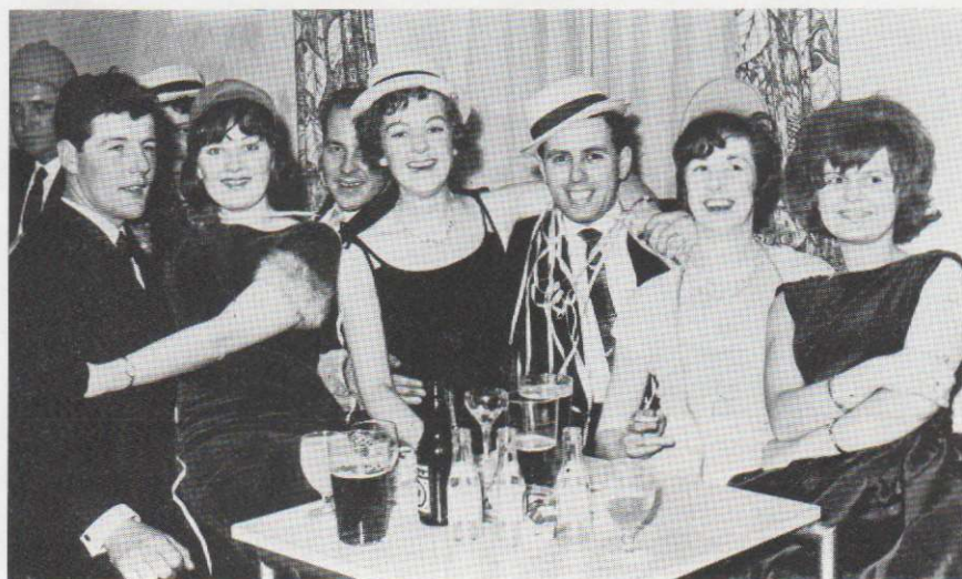
A happy group at Bridgend Staff Party