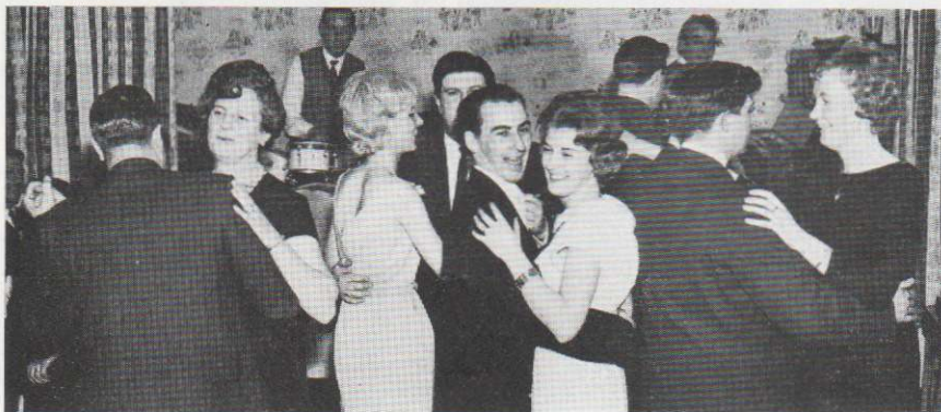
Dancing at the Sales Ledger (Bristol) Buffet Dance.

The evening proved to be varied and entertaining and catered well for people of all ages. There was plenty of dancing for the active members, and some old-time singing for the not-so-agile, organised very successfully by the Band.