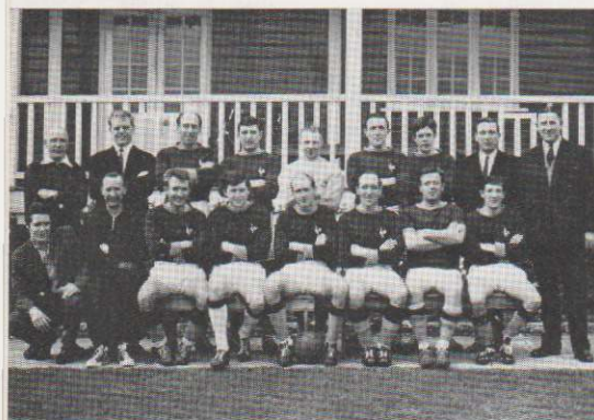
Courage (London) A.F.C. Reserves