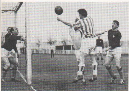
Courage (Bristol) attacking the Courage (London) reserves' goal during the game at Bristol which resulted in a 5—0 win for the home side