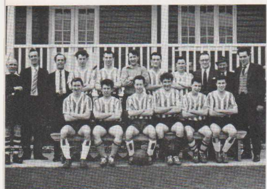
Courage (Bristol) A.F.C.

The Committee would like to see many more members of the Staff making use of the courts and anyone interested would be most welcome. We have a Club Evening every Wednesday, American Tournaments and an Annual Club Championship, details of which appear in the fixture card.