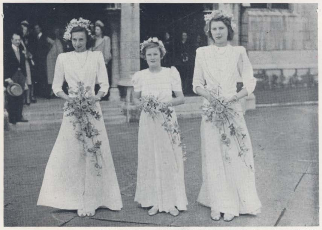
Reproduced by kind permission of The Queen's Press, 3 & 4, Royal Opera Arcade, Pall Mall. The Bridesmaids.