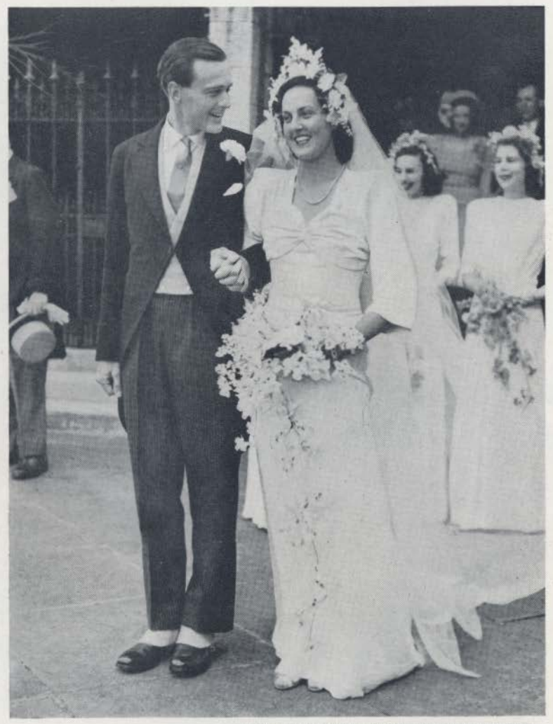
Reproduced by kind permission of The Queen's Press, 3 \odot 4 , Royal Opera Arcade, Pall Mall.