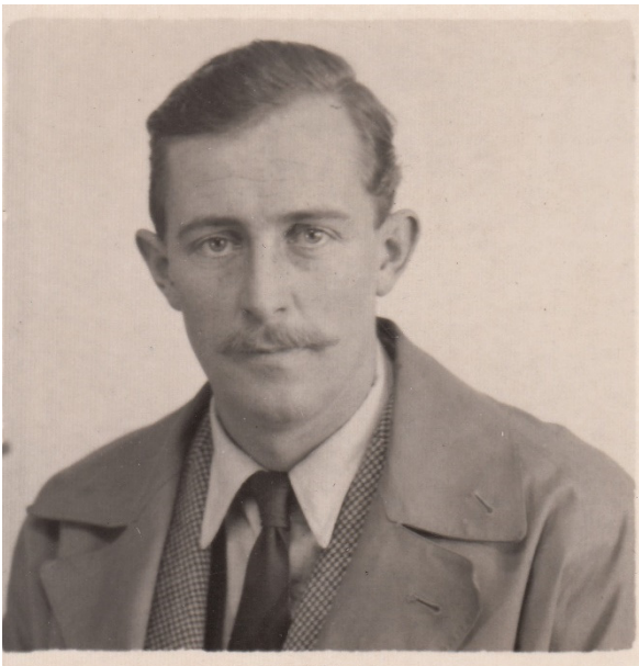
The changed man who came home from South Africa in 1943