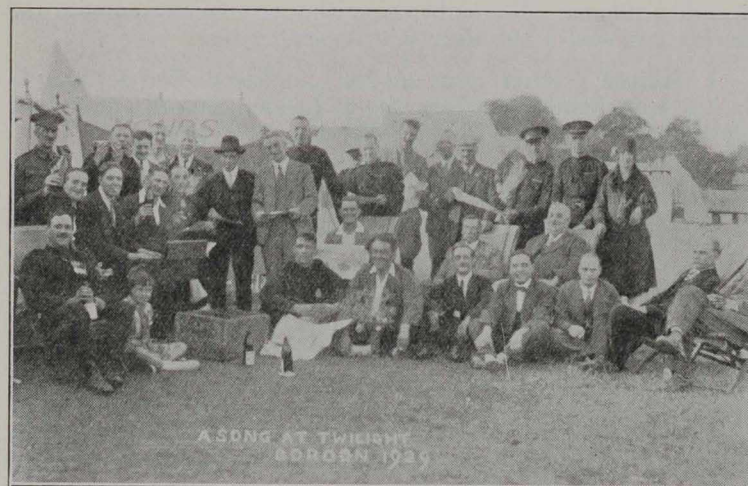
Sergeants' Mess, 11th London Regiment.