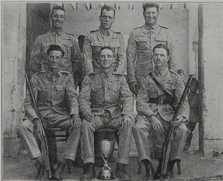
The Royal Engineers, winners of the Ferrary Cup.

The rains which we thought were coming are holding off, and except for a thunderstorm, there has not been a drop since the last reference to them in the GAZETTE.