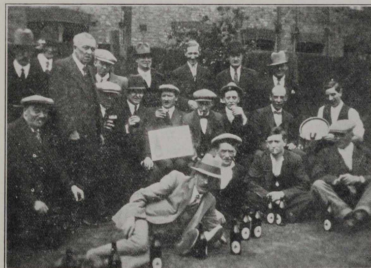
"S.B." Boys, Tooting Conservative Club.